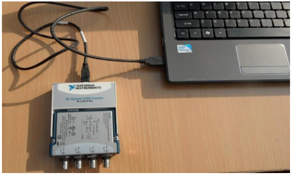
Figure 2: The items used in data acquisition process (Triaxil transducer, Adaptor to hold transducer, data acquisition card and interfacing with Laptop)

Two integrated electronic piezoelectric (IEPE) sensor connected to BNC connector .One of the sensor are attached to steering (z-base) and second one sensor are attached to driver forearm and upperarm (near shoulder) (z-target) ,so we get The collected data was processed and analyzed with LabVIEW TM and by using MATLAB programme for each test. First and foremost subject of the test was given written information about the experiment, which included the purpose of the study. The tractor that are used in experiment was in working condition, tyres of the tractor for the test were of standard size. Tests are carried out on FARMTRAC 50 model on ploughing field which is shown in figure (3).